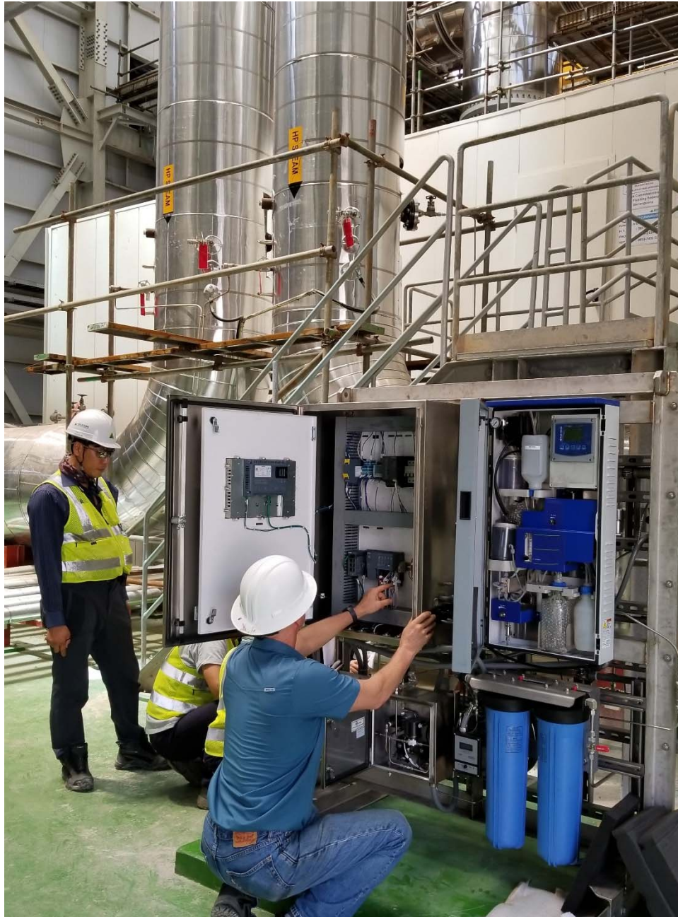
Commissioning New Steam Purity Analyzers at Silangkitang and Namora-I-Langit geothermal Power Plants (330 MW) in Sumatra, Indonesia