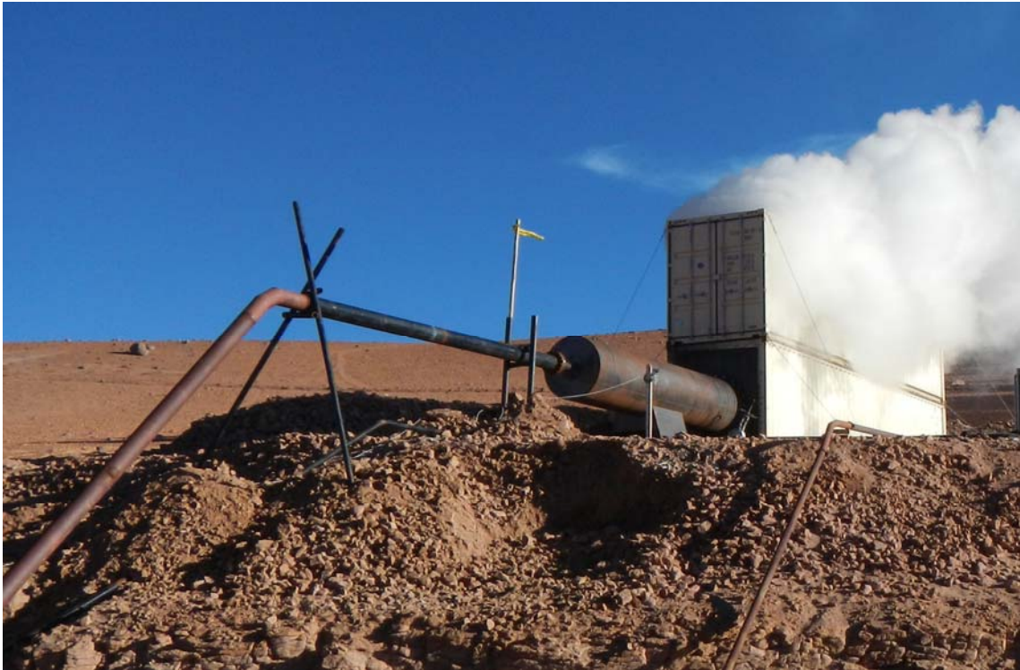
Figure 4. LECM in Bolivia