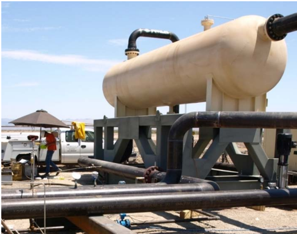
Figure 2. Production Test Separator