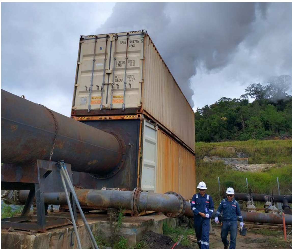
Figure 5. LECM in Sumatra